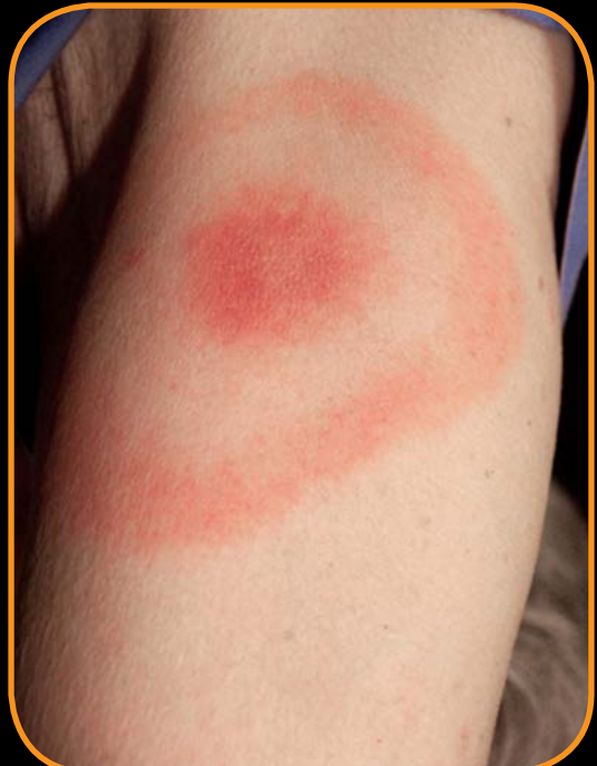
Bull's-eye rashes (erythema migrans) can be an early sign of Lyme disease, but not all cases present with this characteristic rash.