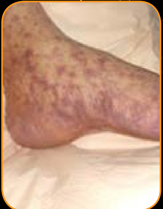
Late stage rash in patient with Rocky Mountain spotted fever.