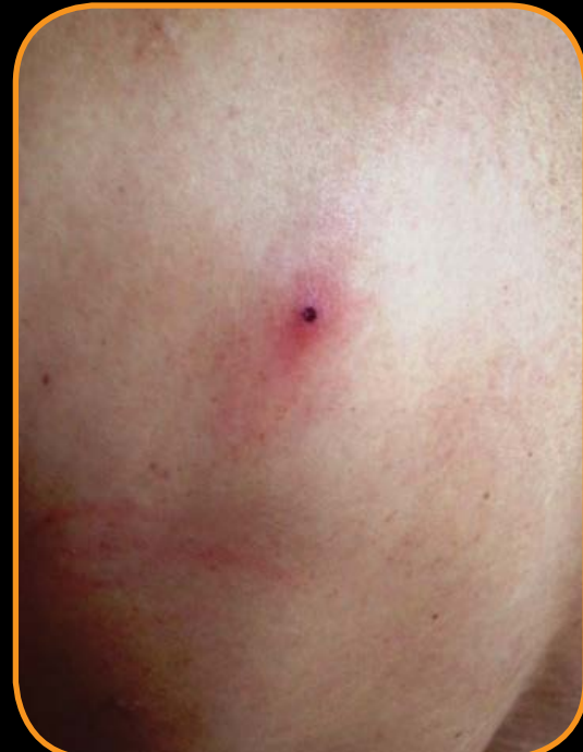
This persistent, itchy rash was the result of a blacklegged tick bite. The patient experienced no symptoms other than the rash.