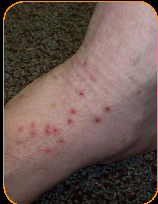
These spots look like a rash but are actually itchy welts caused by multiple lone star tick larvae bites.